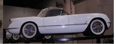
Five Star Bowtie