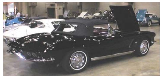
Road Warrior at Convention